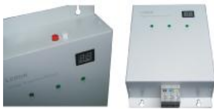
Appearance and installation dimension