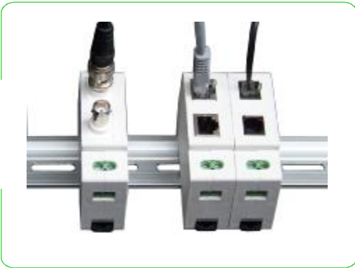
Appearance and installation dimension